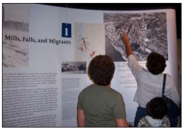
Weaving a World encourages family interaction and sharing of stories.